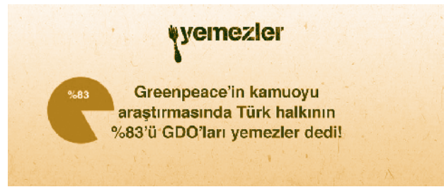
Figure 1 I don't eat it 83% According to Greenpeace's public opinion poll, 83% of Turkish population said they don't eat food products with GMOs.

In the second stage of the campaign, the banning of the GMO food was achieved. The 29 importation applications of TGDF were withdrawn and the campaign succeeded thanks to the petitions made within the scope of the Yemezler campaign, protests, news that appeared in the traditional and social media, and the sensitivity shown to the subject by the public. The details of the campaign conducted by CSOs with the support of the public can be found below.